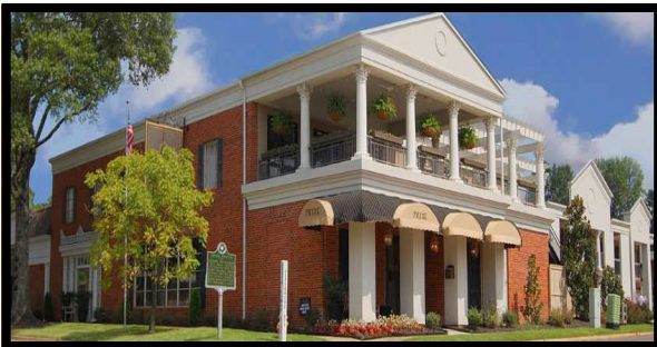
Downtown Oxford Inn

(662) 234-2331 • University of Mississippi http://www.theinnatolemiss.com/new/